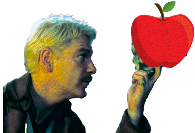
Figure ghost.3: to ghost or not to ghost, that is the question.